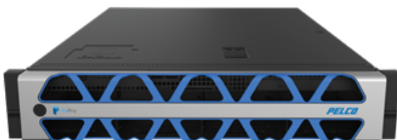
Power 2 Server™