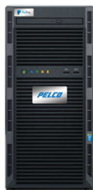
Eco 2 Server™